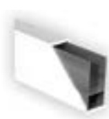
Aluminum "H" Channel