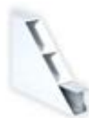
Aluminum "I" Channel